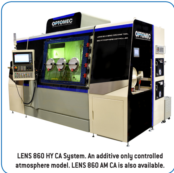
LENS 860 HY CA System. An additive only controlled atmosphere model. LENS 860 AM CA is also available.

Larger Work Envelope & Higher Power Bring More Capabilities for Affordable, High Quality Metal Hybrid Manufacturing.